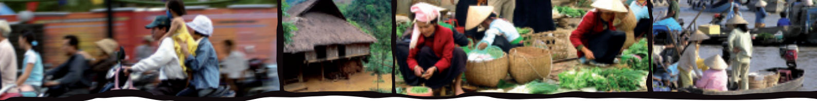
Table 2. Summary of travel health issues for Vietnam & preventative options available